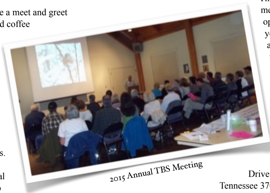
2015 Annual TBS Meeting