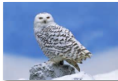
Stan's Favorite Bird

Stan is an active member of the Tellico Village Birders Club. Three years ago Stan established a nest box trail at the Tanasi Golf Course building many of the nest boxes. This nest box trail of 30 nest boxes fledged 96 Bluebirds during 2014.